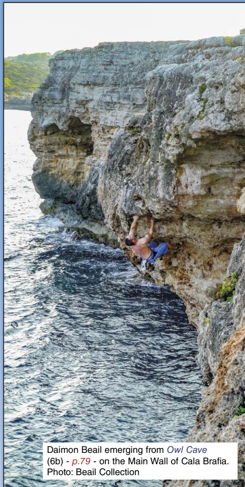
Daimon Beail emerging from Owl Cave (6b) - p.79 - on the Main Wall of Cala Brafia.