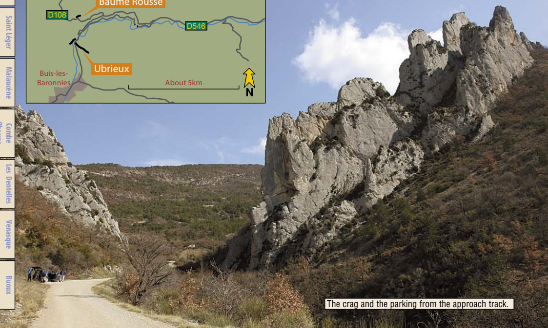
The crag and the parking from the approach track.

The crag faces south, and gets plenty of sun, though the starts are shady when the sun is low. Due to its exposed position, it's not an ideal venue when it's cold and the wind is blowing.